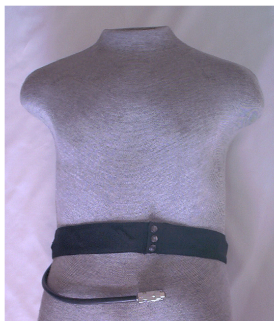
Tactile Guidance Systems (TGS) provide a technological advantage to ground forces.